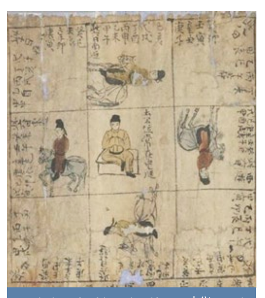
Periodical Transfer of the Earth God (Tugong 土公), ms. Pelliot Chinois 2964; Photo: https://gallica.bnf.fr/ark:/12148/ btv1b8302295m/f3.image.r=pelliot%20chinois%202964

The follow-up workshop in June 2017 focused specifically on the introductory volume of the series: Part 1: Introduction to the Field of Chinese Prognostication . The purpose of this volume is to open up the field of Chinese prognostication as well as answer the question of why prognostication matters in various fields of Chinese studies and the humanities in general. The volume contains two parts: 1. General introductions to aspects of Chinese prognostication (its history, significance, etc.); and 2. Surveys of research on prognostication in various fields, or "states of the field." This workshop was particularly dedicated to the general issues and difficulties that the contributors encountered while writing their respective chapters.