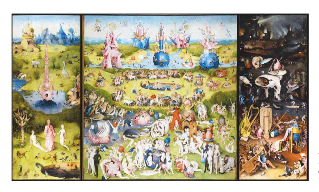
The fall of man as inevitable fate – Hieronymus Bosch's "Garden of Earthly Delights" (around 1500, Museo del Prado, Madrid)