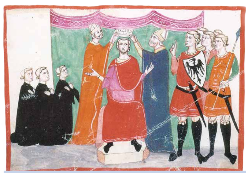
The Coronation of Manfred at Palermo (1258). Illustration from the Chronicle of Giovanni Villani, second half of the 13<sup>th</sup> century, Vatican City, Biblioteca Apostolica Vaticana, Cod. Chigi L VIII 296, fol. 85r

Historiographical writings, such as the Historia de rebus gestis Friderici II Imperatoris ejusque filiorum [...], were composed before Manfred's rise to power with the intention of laying claim to his idoneity; that is, his qualification and