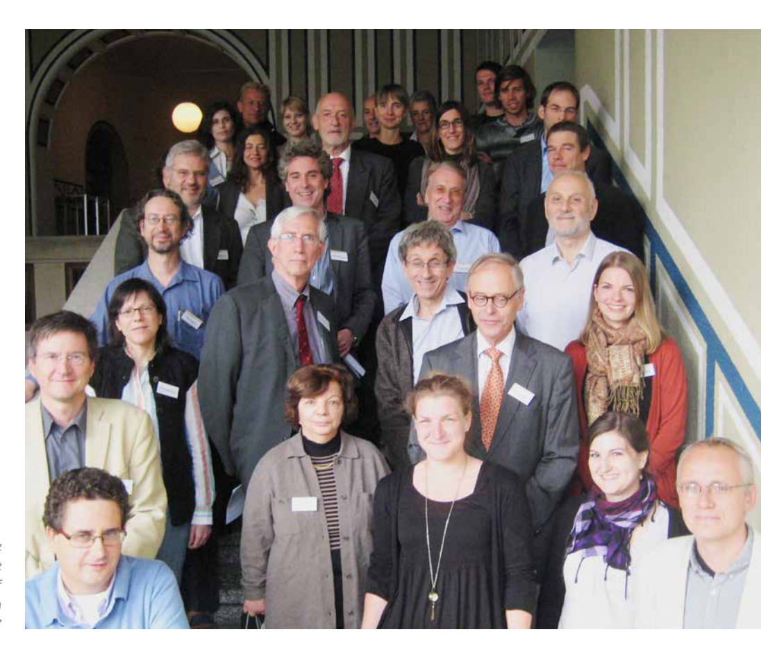
Participants of the conference "Divination and the Epistemology of Prognostic Sciences in the Middle Ages"

and above all medicine, developed elaborate prognosis concepts from the 14th century onward which subsequently made possible conjectural prognoses that were sensitive to the course of events. At the same time, the discussions highlighted desiderata, such as a more precise definition of the concept of "sign" (signum), which possessed a fundamental role for futural knowledge in the disciplines examined over the course of the conference and which has so far been underdetermined in research with regard to its epistemological function.