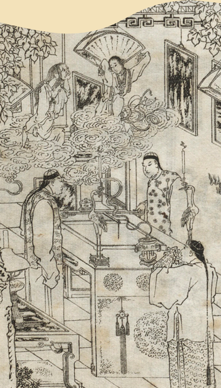
Feiluan xin yu:

Bayerische Staatsbibliothek München, L.sin. K 175-1/10, S. 236.urn:nbn:de:vbv:12-bsb00075644-7.